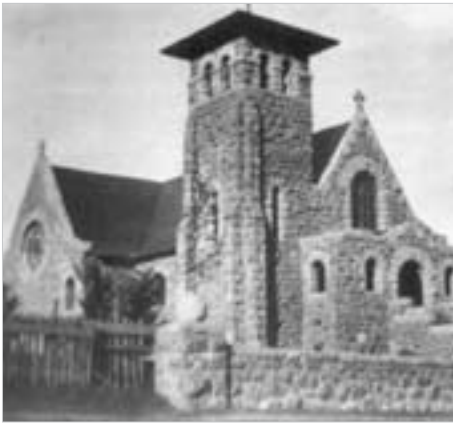
The Church of the Assumption in Tomales, built in 1900.