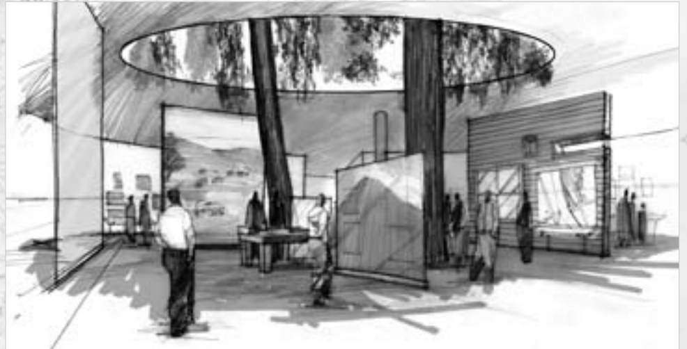
Artist's rendering of the central exhibit area, with artificial trees "growing" up into the central rotunda. (Image by Academy Studios.)

and wealthy residents living in idyllic settings. But Marin County is more than a playground. It is a unique place with a rich and colorful past. Marin is a place of contradictions and odd pairings—of affluence and idealism, along with isolationism and innovation. It is a county where over one-third